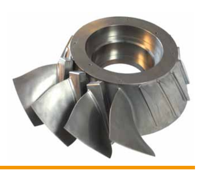
Typical parts produced with Linear Friction Welding: Blisks, IBR, IBF for jet engines, thick joints, aircraft structural parts

Linear Friction Welding (LFW) is a solid state joining process as it does not cause melting of the parent material. It produces forge quality, high integrity joints, with a narrow heat affected zone. The material are forged using frictional heat through the controlled, reciprocal linear oscillation movement of two components under high contact load.