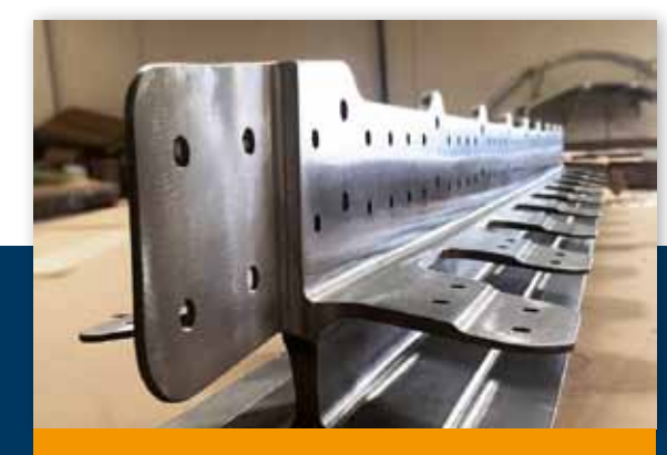
Typical parts produced with Hot Stretch Forming: Titanium airframe components